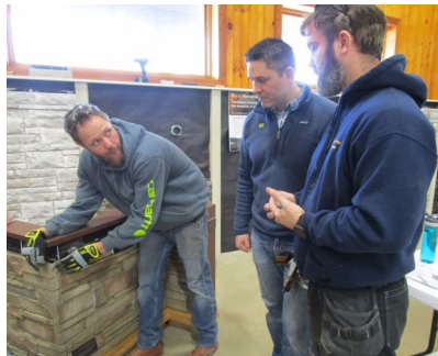
Hands on demos of Boral products.

Henry Poor recently held two seminars featuring Boral's Versetta Stone and TruExterior Siding and Trim. On April 5th local craftsman attended a half day program of product demos, installation best practices and product training. Everyone had a chance to get hands on experience with the different products.