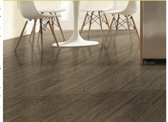
ADURA®MaxAPEX is the next generation of exceptional flooring offered by Mannington.

This innovative product is FloorScore certified and complies to strict indoor air quality standards; won't trap dust, pet dander and other allergens; and most spills clean up with just gentle soap and water.