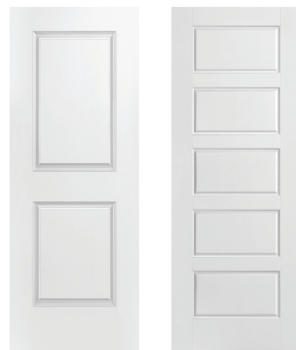
2 PANEL SMOOTH / CAMBRIDGE

When planning your New Traditional room, consider an interior door that has a two-panel design. This classic, artistic design echoes the sophisticated elegance of New Traditional mouldings and will help create a timeless transition from one room to the next.