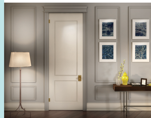
RIVERSIDE / ROCKPORT