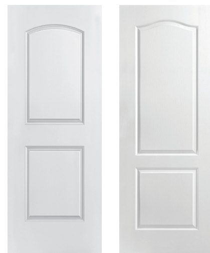
2 PANEL ROMAN / CONTINENTAL