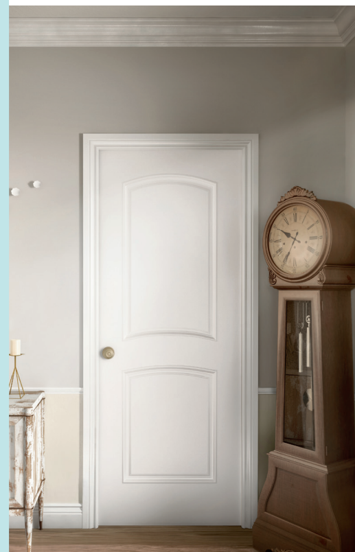
2 PANEL ARCH-TOP / PRINCETON