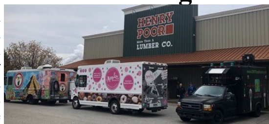
Local food trucks serving outside Henry Poor at the last cookout for 2019.

ing out each month in the heat, cold and rain to take part. Special thanks goes to all our sponsors who helped make each month's cookout a success. We really appreciated your continued support.